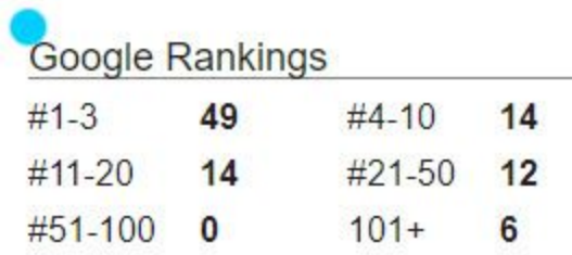
Top 10 Gainers vs Previous Week

We continue to make gains in ranks for important key phrases. As we build authority to advancedhva.com we'll continue to see gains in ranks and traffic in the coming months. We now have 63 key terms on page one of Google. 49 key terms are in the first 3 search positions.