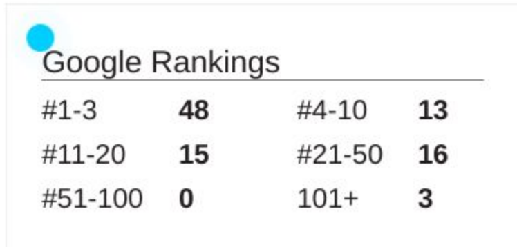
Top 10 Gainers vs Previous Week

We continue to make gains in ranks for important key phrases. As we build authority to advancedhva.com we'll continue to see gains in ranks and traffic in the coming months. We now have 61 key terms on page one of Google. 48 key terms are in the first 3 search positions.