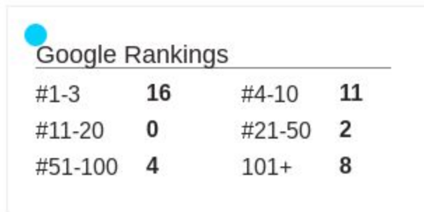
Top 10 Gainers vs Previous Week

We continue to make gains in ranks for important key phrases. As we build authority to vanspawnmart.com we'll continue to see gains in ranks and traffic in the coming months. We have 27 key terms on page one of Google. 16 key terms are in the first 3 search results.